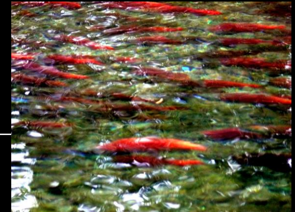
Alternative Certification Team