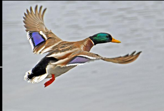
Recruitment Task Force