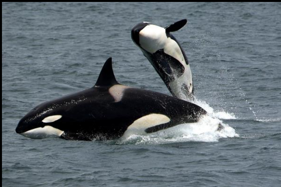
Organizational Health Cadre